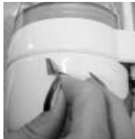
Figure 4 Adhesive pad removal